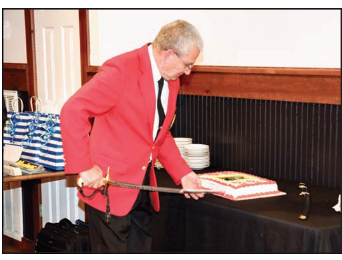
Local Marine Corps League members celebrated the Marine Corps birthday Nov. 10 with this cake-cutting ceremony.

Following the American Revolution, the Marines were abolished in April 1783. Then, on July 11, 1798, Congress ordered the creation of the Marine Corps and directed that it be available for service under the Secretary of the Navy.