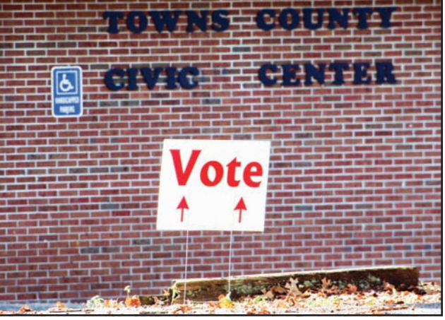
Early in-person voting will take place at the Board of Elections Office, located in the same building as the Towns County Civic Center next to the courthouse.

will occur in the Towns County Board of Elections Office at another application. Suite A of 67 Lakeview Circle in Hiawassee, with voting hours from 9 a.m. to 5 p.m., even during lunchtime. Runoff Election Day voting will take place Tuesday, Dec. 6, from 7 a.m. to 7 p.m. at the Hiawassee and Young Harris precincts of Towns County. Voters may request mailin absentee ballots through Monday, Nov. 28. If people checked that they were elderly or disabled on a previous application this year, they should re-