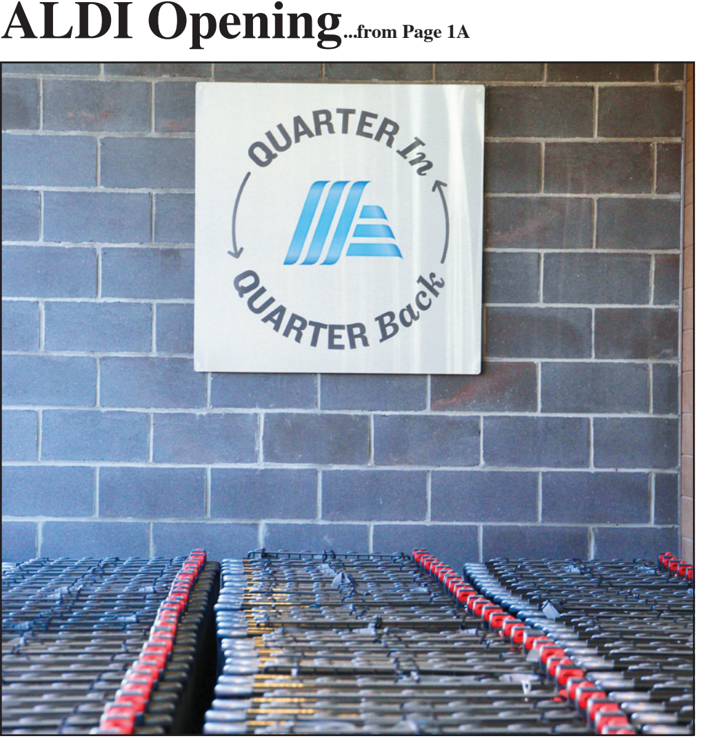
Among other things, ALDI is known for its unique cart system, where customers insert a quarter to borrow one and get their money back upon returning the cart.

For those who would $7 for individuals 12 and up.